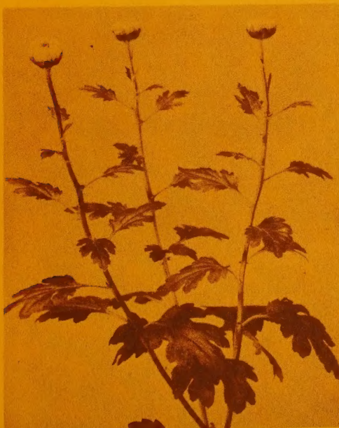
Goldsmith after disbudding

BETTY ROSE LILLIAN DOTY THYRA ENCHANTRESS TUXEDO MASTERPIECE FREIDA DARK PINK FREIDA NORMA LONG ISLAND BEAUTY VALENCIA DARK PINK VALENCIA DARK PINK SUPREME